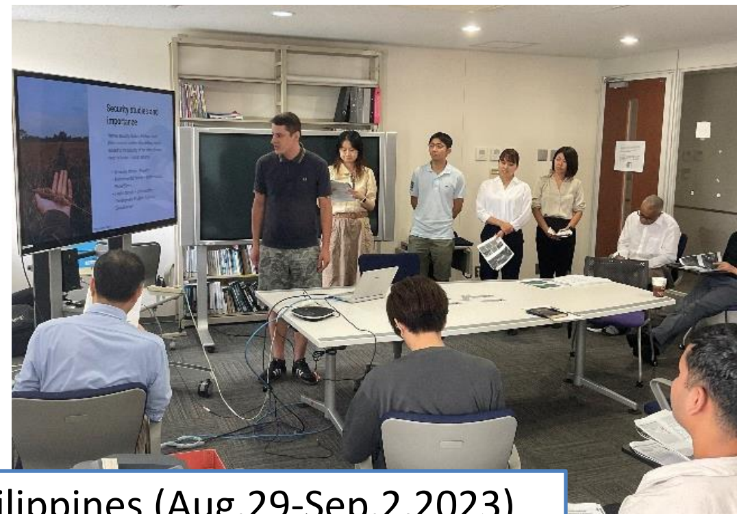
On-site Group Work in the Philippines (Aug.29-Sep.2,2023)