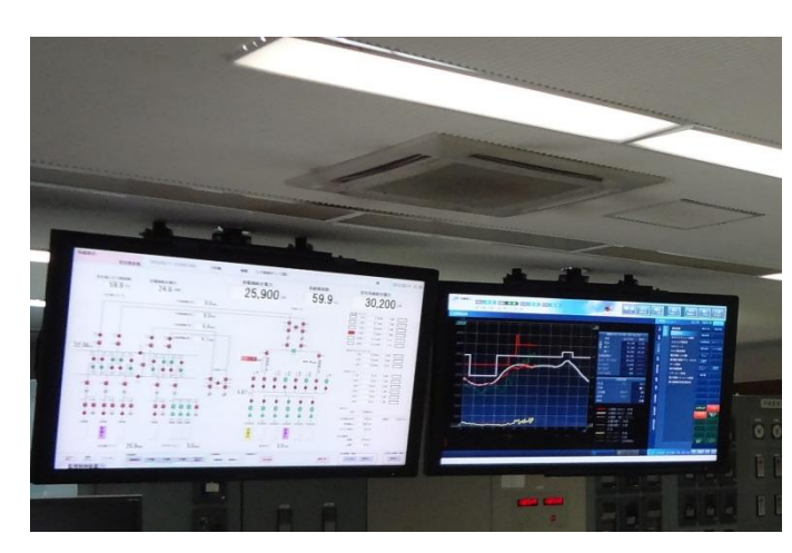
[Figure 2] Control Monitor