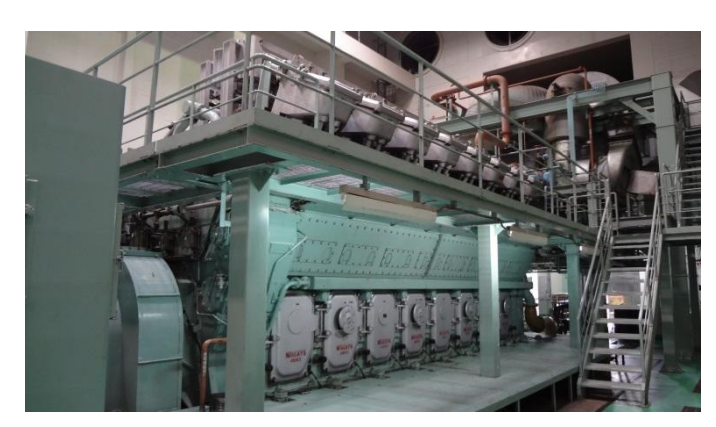
[Figure 1] Diesel-powered engine generator

diesel-powered generator cannot be controlled quickly responding to weather change. For this reason, storage batteries are used to adjust the fluctuation of generating power from renewable energy.